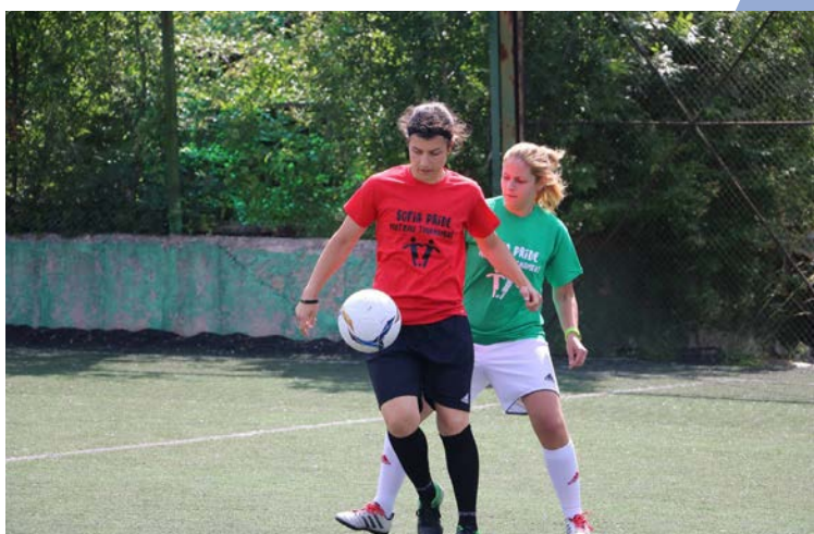
Sofia Pride Football Tournament

The other major event was the first Sofia Pride Football Tournament. The tournament gathered 4 teams of 5 + 1 players. The football tournament was supported and sponsored by FARE network – an umbrella organization that brings together individuals, informal groups and organizations driven to combat inequality in football and use sport as a means for social change