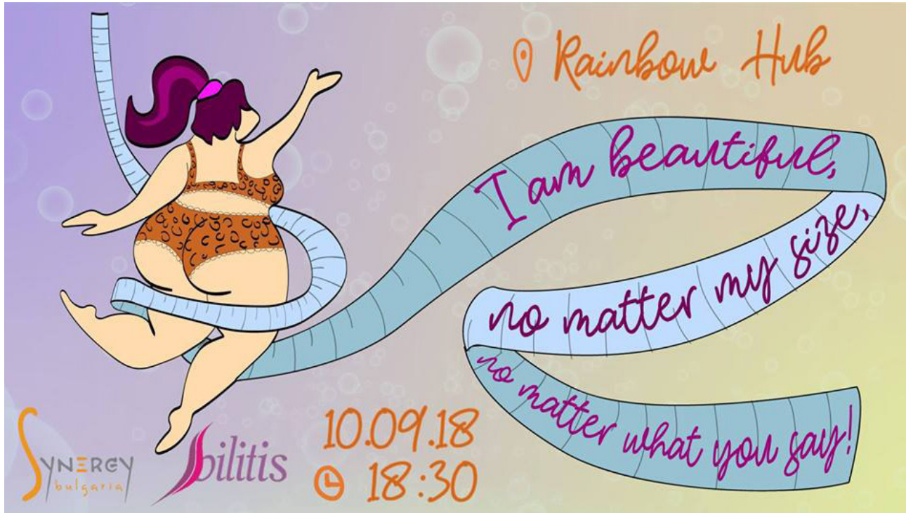
Poster from one of the feminist events on the topic "Fatphobia".

The Queer Feminist Group was the first one to meet on the topic of 'Intersectionality', very important topic in the contemporary feminist movement and suitable base for the future activity of the group. The group was meeting once a month to discuss important for the worldwide feminist movement topics, but also topics that are important for our local context. Some meetings were organized with visiting activists who are specialized in topics such as non-binary identities and fatphobia. The queer feminist group merged in another feminist collective called KEF – eclectic feminism club, which organizes events, addressing pressing feminist issues. We supported the protests by providing and organizing volunteers and logistical support.