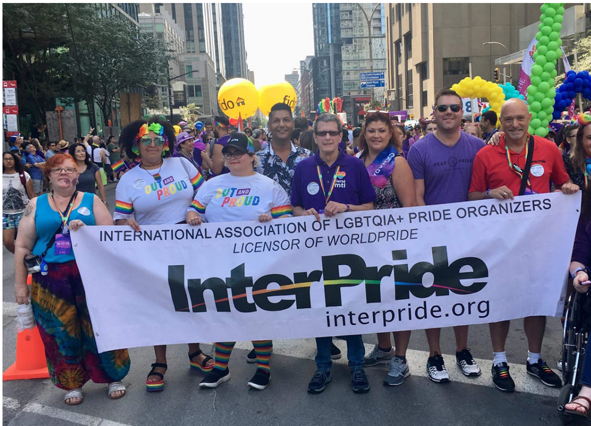
InterPride Board at Montreal Pride, Canada