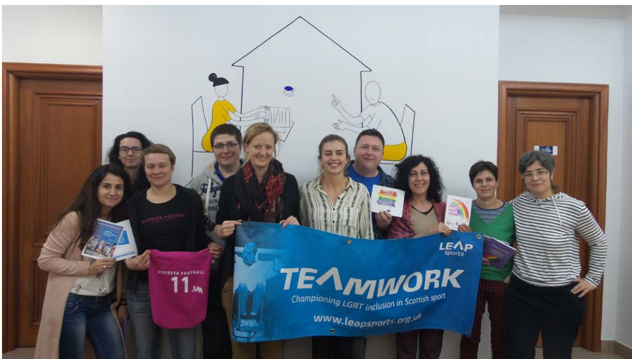
Diverse Identities in Sport - project partners