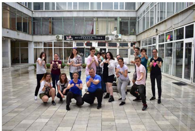
Self-defense workshop, part of the program of Sofia Pride Sports