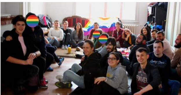
The first BraveLab meeting at the Rainbow Hub, the day after we rented the space