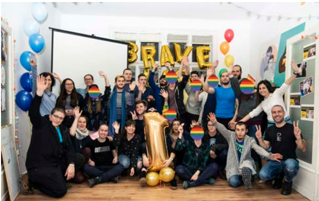
The 1st Birthday of BraveLab

BraveLab started in January 2018 as the first safe space for young people from the LGBTI community in Sofia. Since then young LGBTI people aged 15-29 have regular meetings at the Rainbow Hub to meet and discuss important topics such as awareness of LGBTI identity, coming out, family relationships, workplace and mental health issues, HIV/AIDS prevention and other STIs. BraveLab's goal is to become a sustainable incubator for building confident, capable, and empowered young leaders of the LGBTI community, giving them space to develop their skills, share ideas with peers, and most importantly, build up belief in their own strengths.