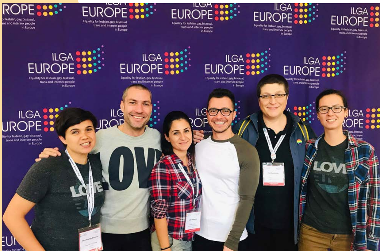
Activists from Bilitis, GLAS and Deystvie after Sofia was awarded to host the ILGA-Europe Annual Conference in 2020