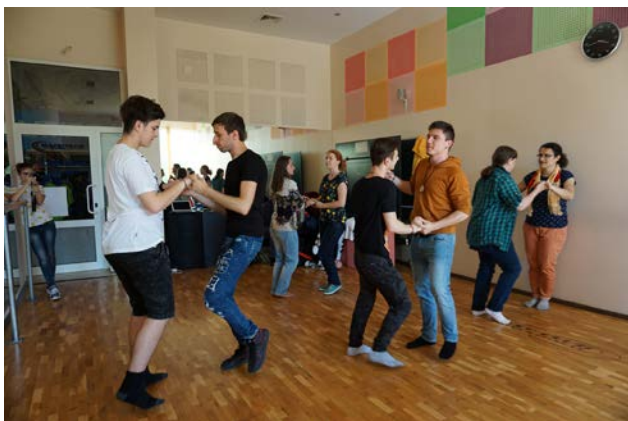
One of the sports events during Sofia Pride Sports -Bachata Dance Class

The first edition of Sofia Pride Sports kicked-off with a same-sex couples bachata dance lesson, followed by the Equality Run.