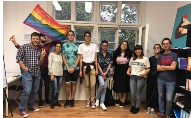
Young People from the BraveLab group