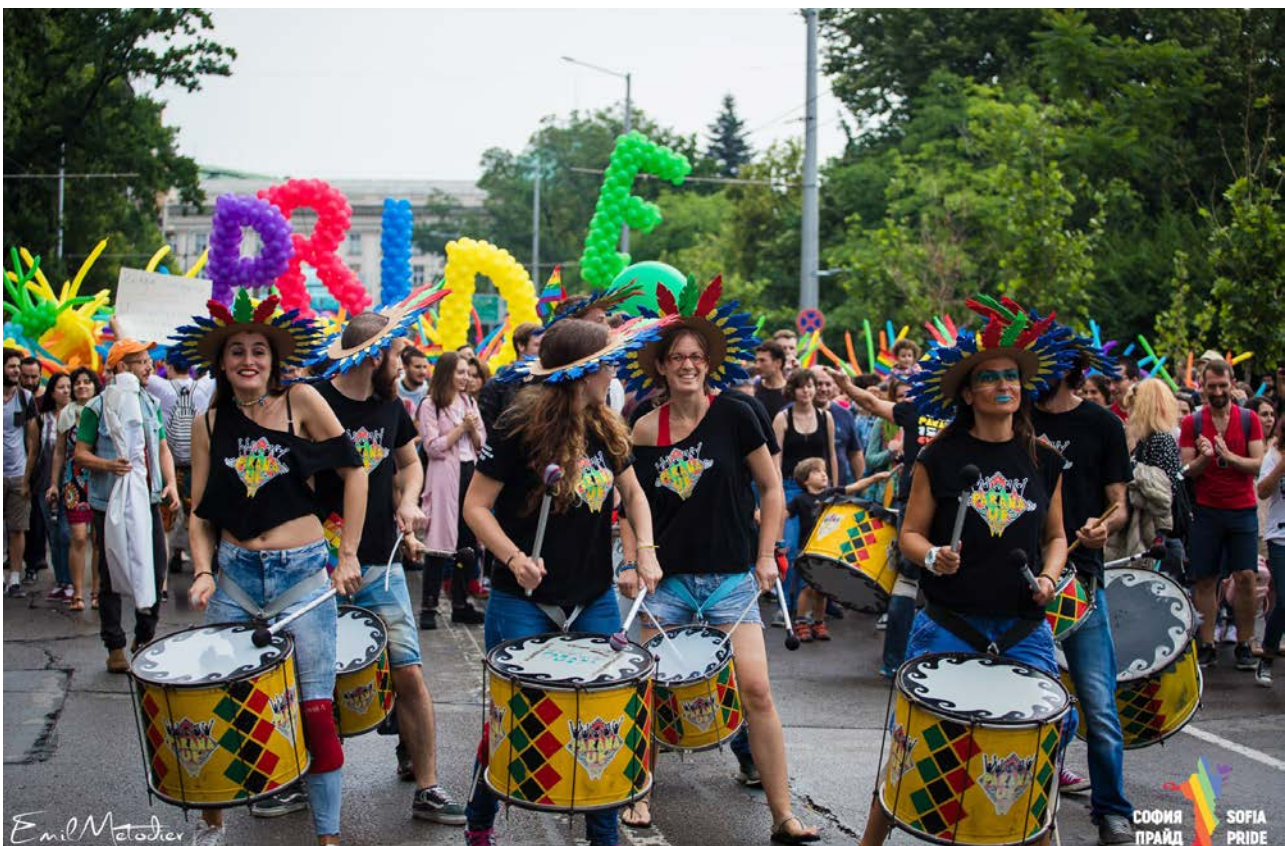
Sofia Pride 2018

Another innovation was the festival atmosphere offered for all guests of the Pride Day! From 4 pm until the beginning of the street March at 7 pm at the gathering point in front of the Monument of the Soviet Army, there was a variety of attractions to attend – information booths with materials and merchandise of the LGBTI organizations, make-up station, photo-booth, messages station, beverages, limited edition products of the businesses who support Pride and various other attractions. A number of companies and businesses attended Pride with their own stands and the festival atmosphere was highlighted by the participation of Ruth Koleva, Ivo Dimchev, Mihaela Fileva, Dancing Sofia, Yam-badon, Spice Girls Tribute, Jennifer Benediction and Dead Man’s Hat Live who performed on the Pride stage.