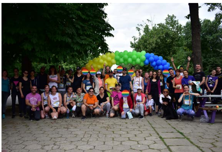
Participants at the Equality Run after the medal ceremony

The Equality Run was funded by the Sofia Municipality Program for Development of Physical Education.