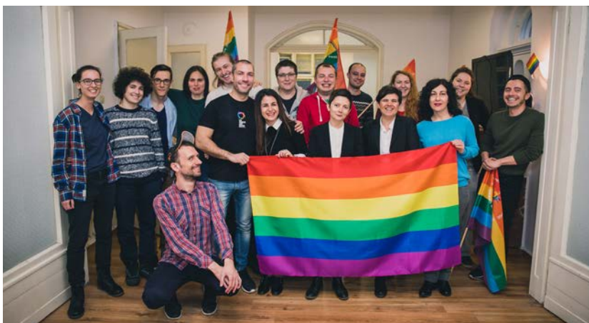
At the opening of Rainbow Hub - the first LGBTI+ community center in Bulgaria